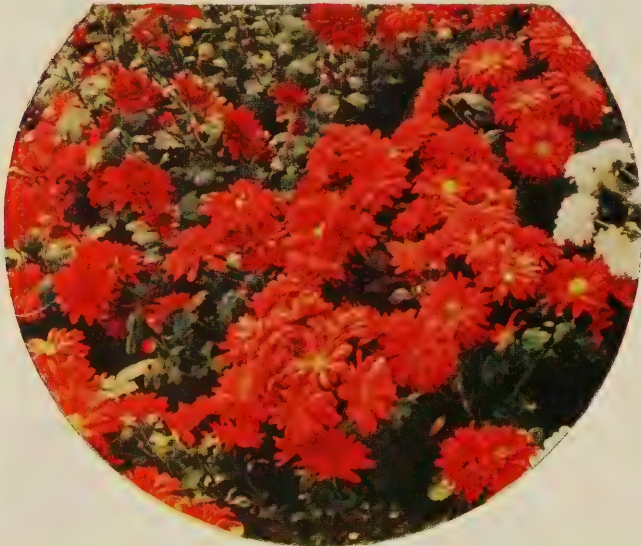
ROUGE CUSHION. 60c each; 3 for $1.50

6 Color Mounds COLLECTION A selection of six very fine, early-blooming, low-growing kinds. Ideal for foreground or border edging. 6 Sure-to-Bloom Plants $2.65 (1 of each pictured)